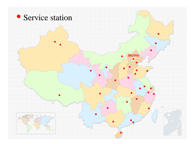
Figure 1. National Distribution of NSTL Service Stations

At present, there are 40 NSTL service stations covering 29 provinces of mainland China [14]. The national distribution of service stations is shown in Figure 1 below. To make the range of coverage clear, there is only one red point marked in each city in the figure, but some cities such as Chengdu, Tianjin, Lanzhou, and Wuhan have more than one service station. In particular, there are two service stations located in Beijing, a transportation service station and an electronic technology service station, built in accordance with its industrial characteristics of physical distributions. These two tangible and intangible approaches to every corner of the country provide advantages for the spread of information.