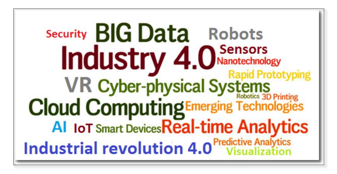
Figure 2: The Fourth Industrial Revolution pillars