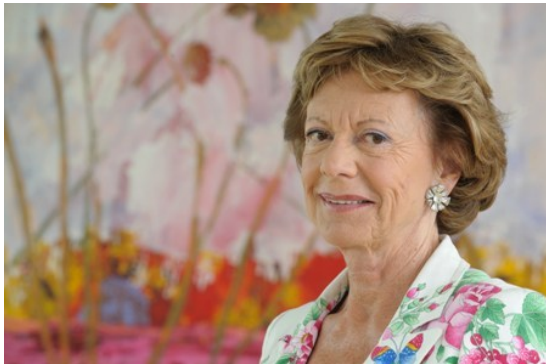
Vice-President Neelie Kroes Digital Agenda Digital single market