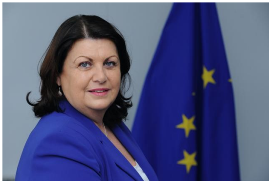
Commissioner Máire Geoghegan-Quinn Research & Innovation European Research Area (ERA) & Innovation Union