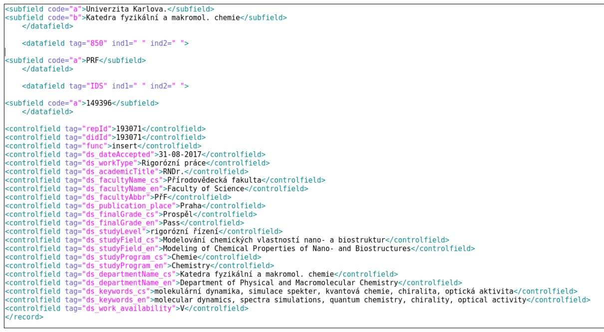
Figure 4: Custom thesis metadata in MARCxml export

For custom descriptive metadata that are not part of the standard bibliographic record, control fields are used. These are not used as a data source for the document's bibliographic description during Aleph processing and are generated just for the purpose of the DSpace ingestion workflow. An example of this part of the metadata export is shown in Figure 4.