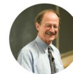
Harold Varmus Lewis Thomas University Professor, Weill Cornell Medicine, New York, and Senior Associate Member, New York Genome Center