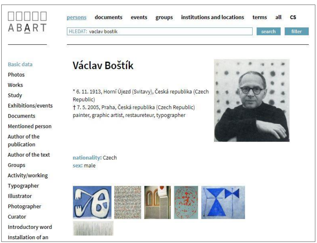
Figure 2 – English version