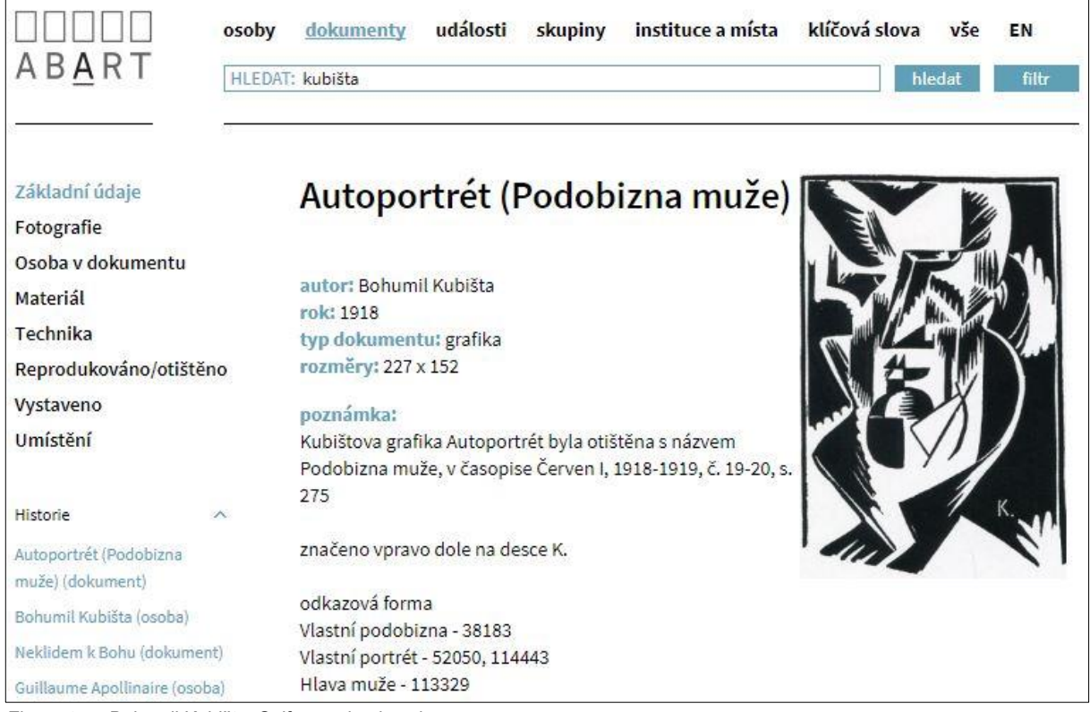
Figure 6a – Bohumil Kubišta. Self-portrait – location

printer. The location of a document (book, magazine, cutting, invitation, poster, work, etc.) is a special multiple identifier (document-institution).