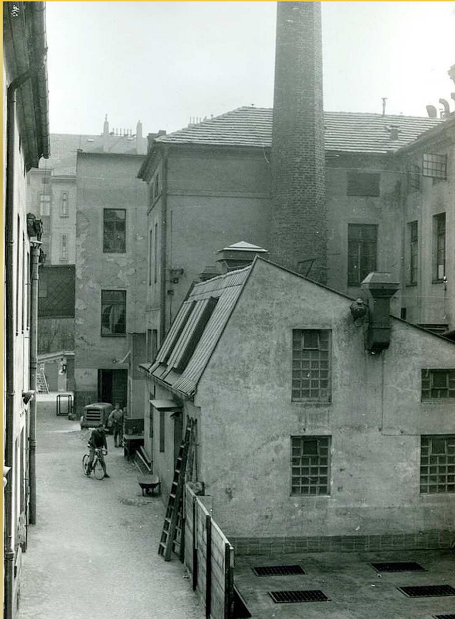
Historical location of FRIP (Prague - Smíchov)