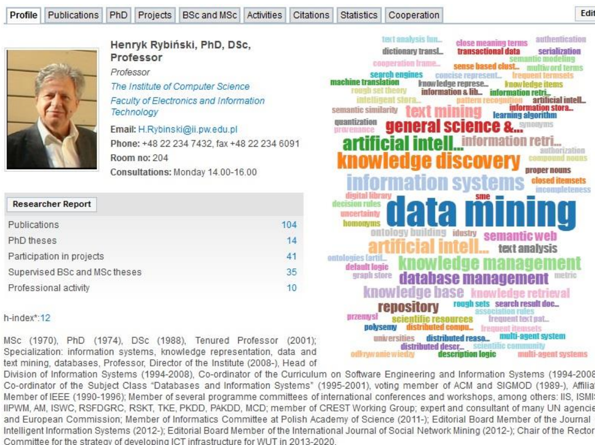
Figure 2 Researcher's profile

Similar to the faculty profile, also in this case, all information concerning the scientific activities of the researcher are divided into groups and provide the following information: