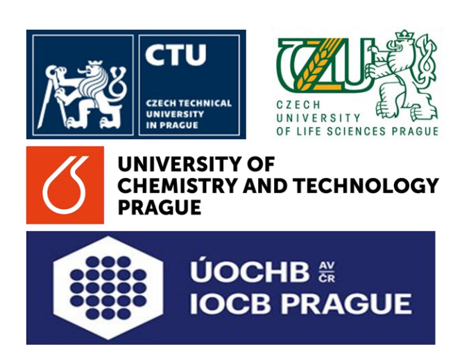
Prague academic partners of the NTK

The collections of the UCT and IOCB are partly integrated into the shelves of the NTK, but are also located in different departments throughout the campus. The VuFind-based NTK catalog provides an integrated search over all collections and a detailed description of the location of each copy. Having a much larger collection integrated into the NTK, the library of the CTU can be searched online via a separate catalog and can be accessed in a declared area within the building of the NTK. A valuable service