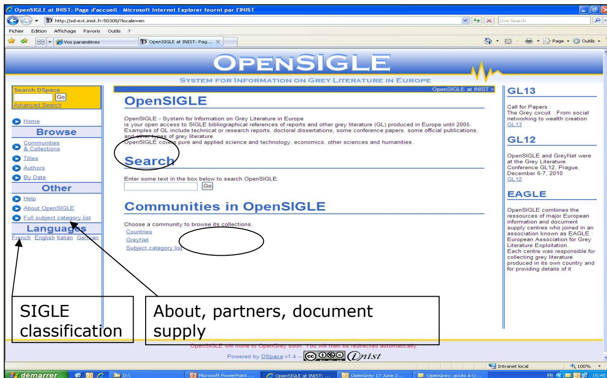
Figure 1: OpenSIGLE homepage

With the goal to improve the access to information on document supply through the general layout, improved record display and additional links and re-open OpenSIGLE for “new” input and close the gap between SIGLE and today INIST-CNRS decided to move OpenSIGLE to new technology.