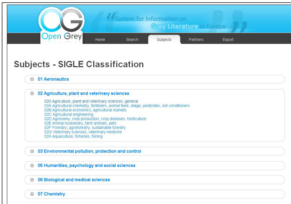
Figure 32: OpenGrey subject

List of partners contains general information about the organization, information on how to obtain a copy from old SIGLE records and links to grey literature repositories or projects in the country.