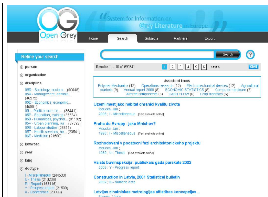
Figure 32: OpenGrey search

“Basic search in OpenGrey is done in a Google-like field. Exalead offers the possibility to refine the results through faceted search. The new criteria are added to the query field and the search strategy can be copied and saved. The indexes chosen for refinements (such as author, subject, date, language...) are similar those of the Czech repository NUSL/NRGL 2 .” (Stock, 2011)