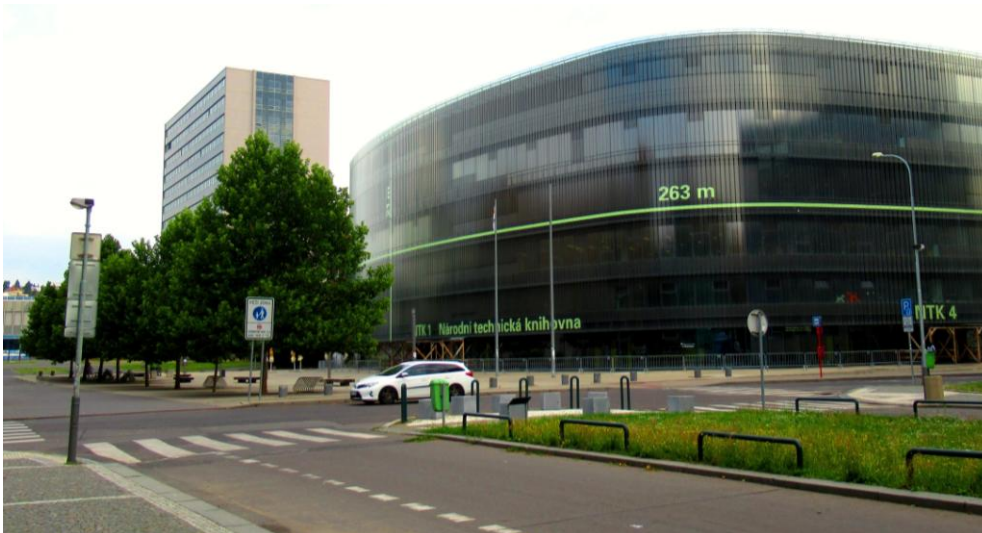
The Czech National Library of Technology (Národní technická knihovna, NTK) in Prague, view from south.

The building includes about 1,300 workplaces for users, a cafeteria, a gallery, and a bookstore. Moreover, it houses a branch of the Municipal Library of Prague (Městská knihovna v Praze). The NTK holds more than 1 M printed books and 515 printed journals, of which around 500,000 volumes are accessible in open stacks. The library further provides access to more than 70,000 electronic books and 50,000 electronic journal titles.