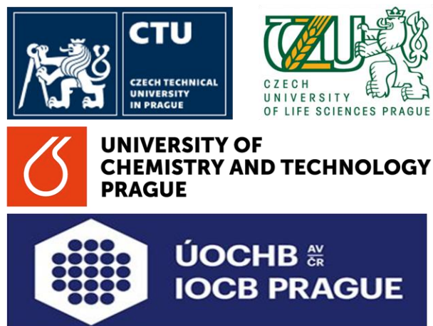
Prague academic partners of the NTK

The collections of the UCT and IOCB are partly integrated into the shelves of the NTK, but are also located in different departments throughout the campus. The VuFind-based NTK catalog provides an integrated search over all collections and a detailed description of the location of each copy. Having a much larger collection integrated into the NTK, the library of the CTU can be searched online via a separate catalog and can be accessed in a declared area within the building of the NTK. A valuable service for chemists is provided by chemTK. This collaborative portal of the NTK, UCT, and IOCB not only allows an in-depth search within the chemistry collections of these institutions, but also facilitates user's access to important chemistry databases such as SciFinder or Reaxys.